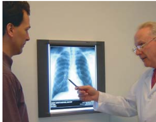
Medicanvas easily converts to an office clinical tool.