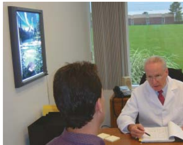
Medicanvas shown with office transparent artwork.