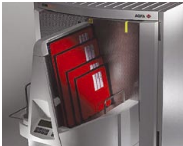
Integrated CR user station for time-saving identification and optimized workflow